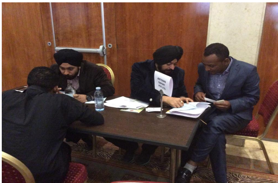
BUYER SELLER MEET IN PROGRESS