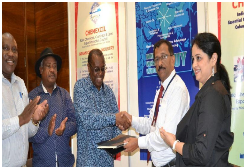
MoU SIGNED BETWEEN CHEMEXCIL AND TCCIA