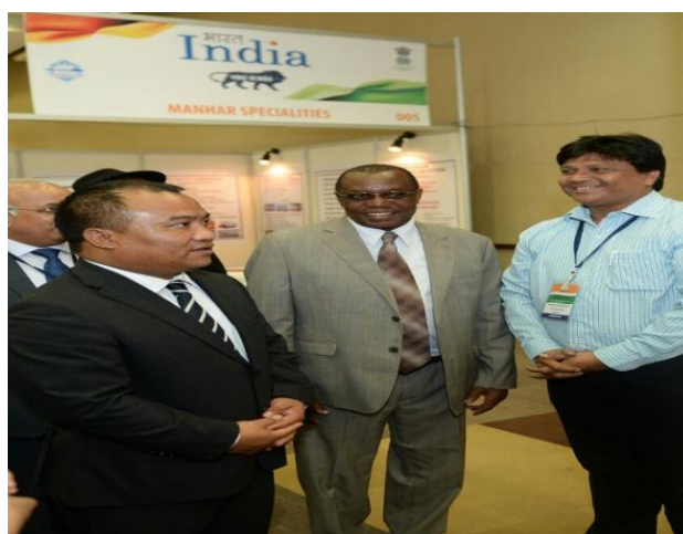
VISIT TO EXHIBITION