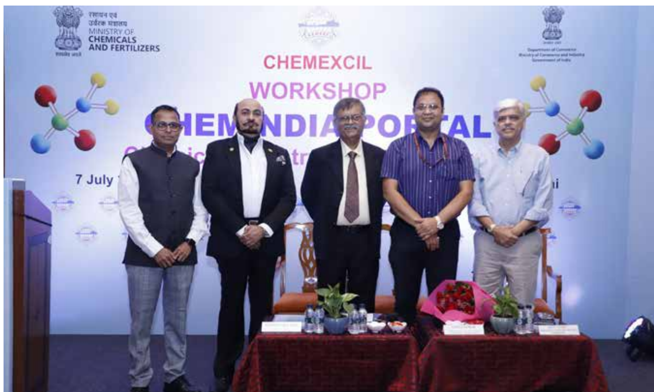
CHEMEXCIL in collaboration with Department of Chemicals and Petrochemicals organized one-day workshop on “Mandatory Data Submission on the CHEMINDIA Portal” on 7th July 2025 at, Mumbai.