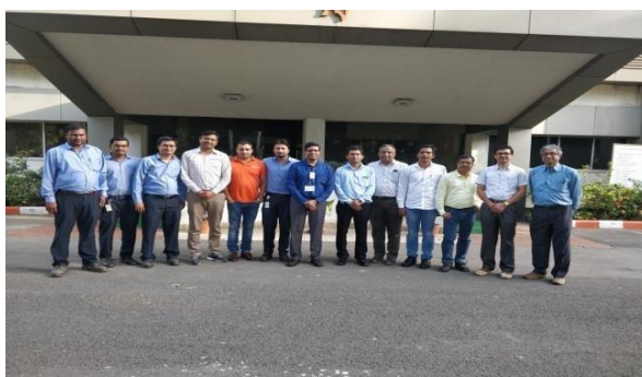
Onsite Training NFIL, 7 th & 8 th June 2019