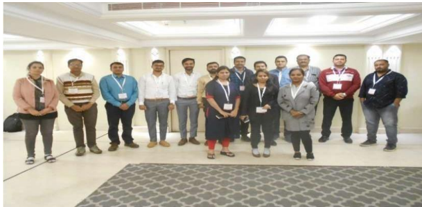
8th Classroom Batch 28th Dec' 2019