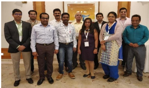
1st Classroom Batch, 21 st & 22 nd Dec 2018