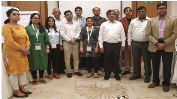
6th Classroom Batch 11th & 12th Oct 2019