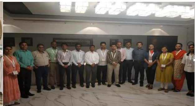
7th Classroom Batch 30th Nov'2019