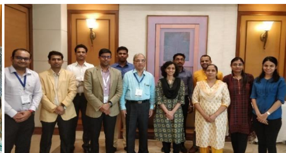
5th Classroom Batch 30 th & 31 st August 2019