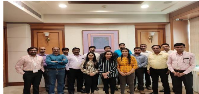
9th Classroom Batch 25th Jan' 2020