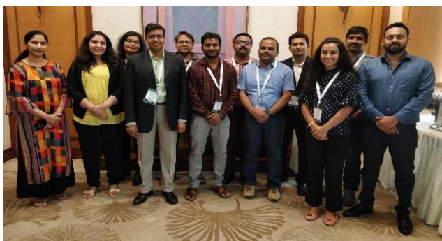
3rd Classroom Batch, 26 th & 27 th April 2019