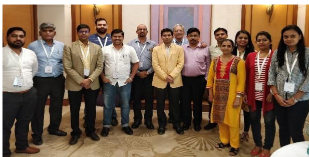
4th Classroom Batch, 12 th & 13 th July 2019