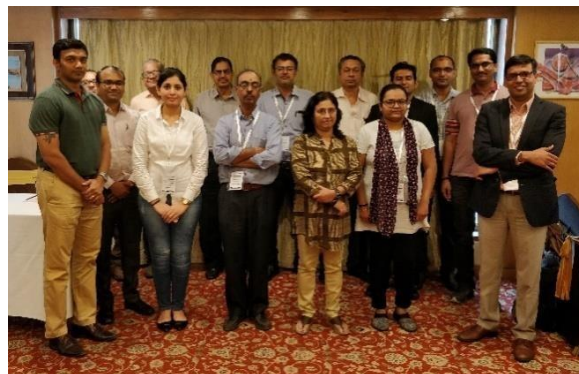
2nd Classroom Batch, 22 nd & 23 rd Feb 2019