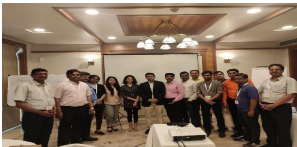
10th Classroom Batch 29th Feb' 2020