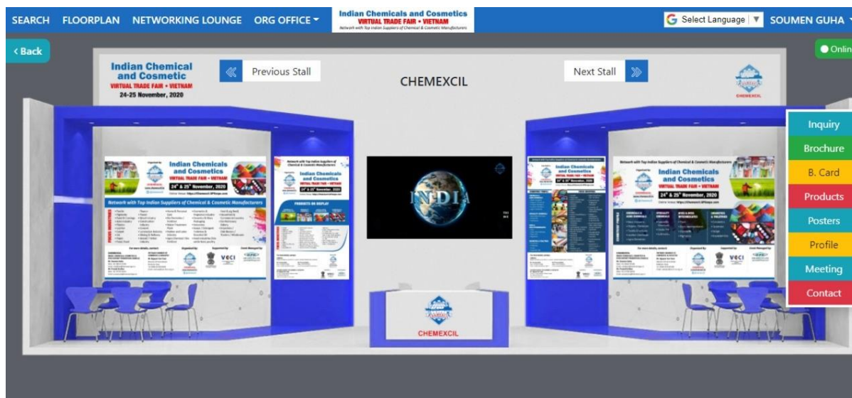
View of Chemexcil Stall in the Indian Chemicals and Cosmetics Virtual Trade Fair, Vietnam