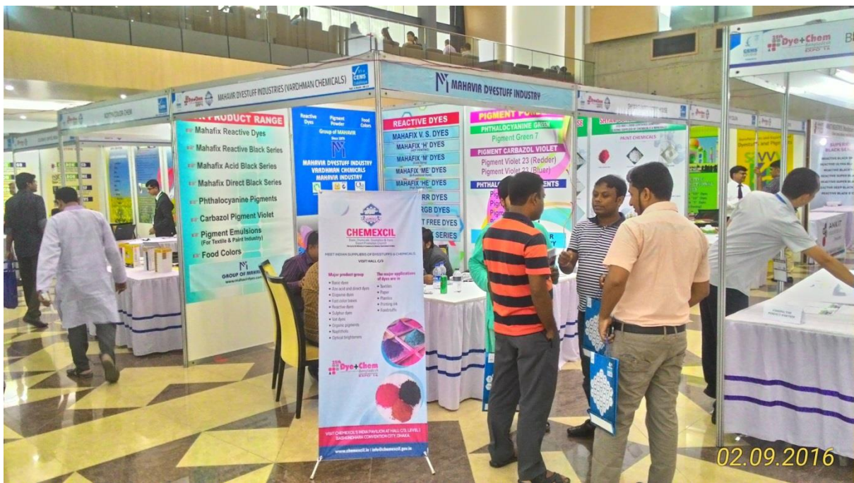
4. View of Indian Pavilion during Dye+Chem Bangladesh 2016 show