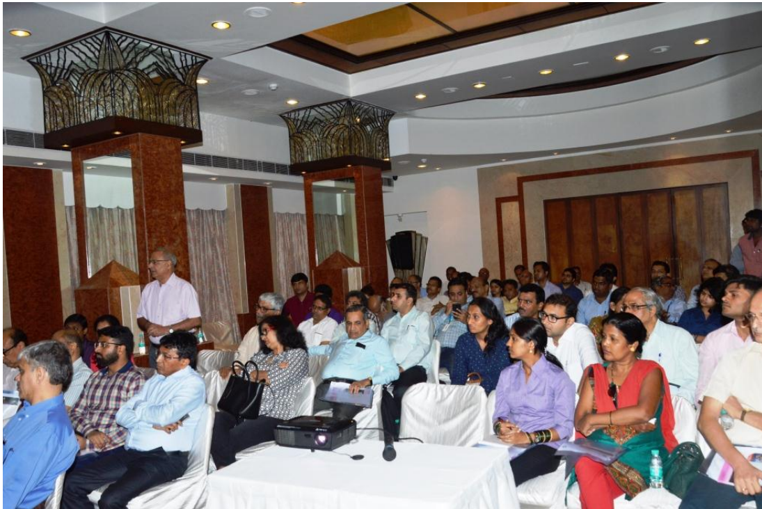
Participants asking queries during the seminar