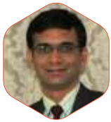
RUPARK SARSWAT CRODA