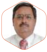
SIVASAILAM N IAS (Retd)